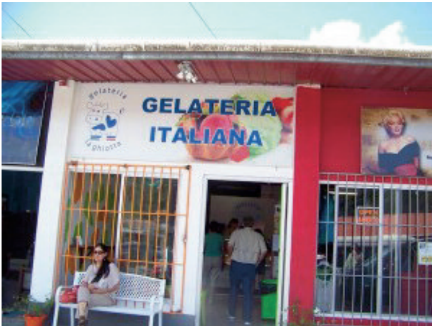
Many expats have started restaurants in Panama. This required a lot of upfront capital. Consider buy an existing business as it's more affordable than starting a new one.

You can find a business for sale by simply doing a Google search for “business for sale Panama,” or in the country you are considering. You can also look in local newspapers. If you feel enthusiastic enough, you could find a business that looks like it isn’t doing well, and then make the owner an offer to buy it. This may or may not work, depending on